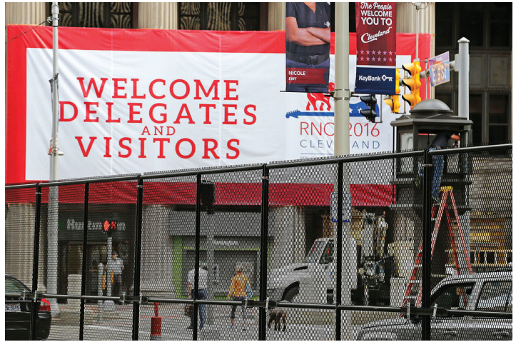
Figure 2 (Right) Steel fencing surrounded the perimeter of both the event zone and the SSSZ. It was at least 10 feet tall and hard to see through.

(Rienzi, 2000; Emerson, 1970). However, when the safety valve closes, protesters must begin to look for other means of being heard. One choice is belligerence and destruction. 1 Another is mockery and shock.