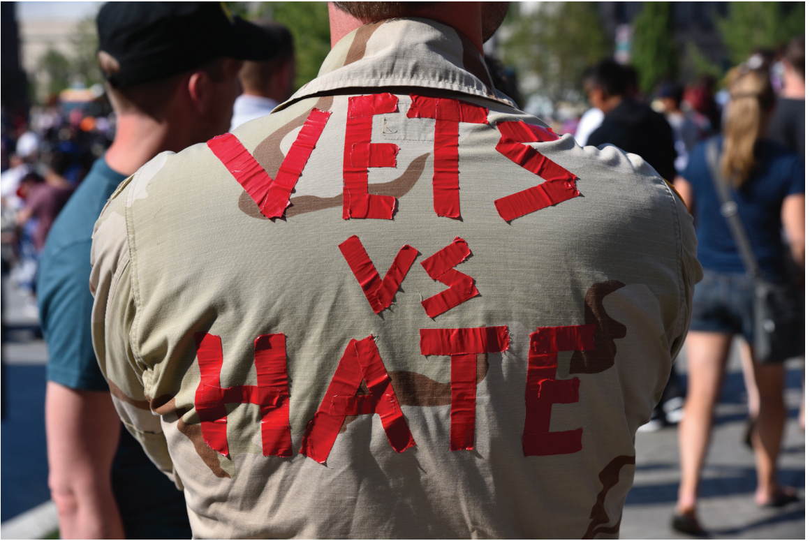
Figure 13 This man wrote his message in red tape, to protest both the Republican message and government incompetence in general.

looks weird enough that you're taking my picture. And you're not the first one. And everything government does is just red fucking tape" (see Figure 13).