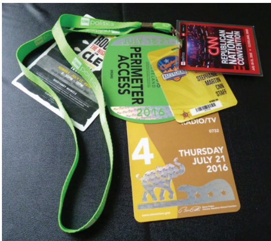
Figure 6 Entry into the SSSZ required badges, and different areas required different badges. The badging system itself demarcated who was safe and not, belonged and did not.