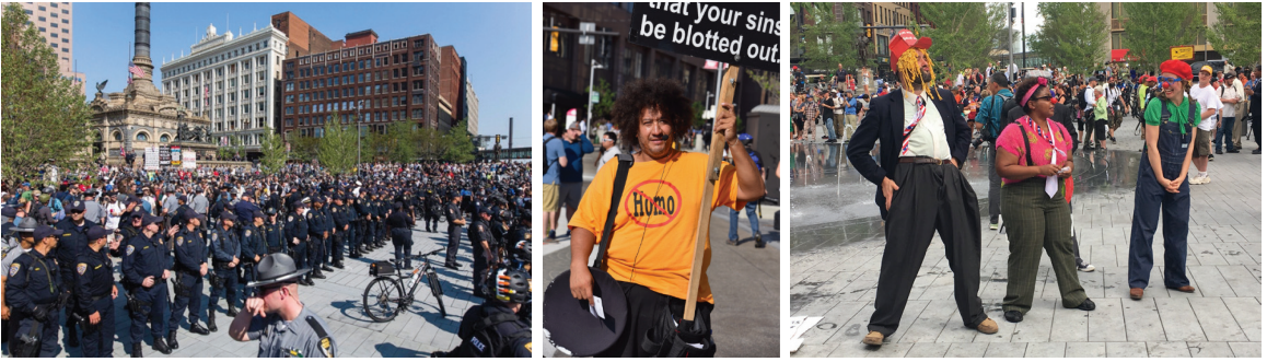
Figure 10 (Left) Police ringed the area around Public Square in Cleveland, where protest demonstrations were allowed to take place.