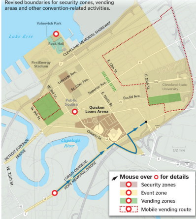
Figure 1 (Left) Map of the “event zone, approximately 1.7 miles across. The darker brown area near the Quicken Loans Arena is the Secret Service Security Zone, which required special badging to access.

Revised boundaries for security zones, vending areas and other convention-related activities.