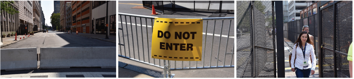
Figures 3, 4, and 5 (Left to right) In the few places where high metal fencing was not practical, concrete barriers and metal gating were used instead. To pass into both the event zone, and the SSSZ, all visitors had to pass through security check points, including bag checks.

credentialed media. Passage through here required a perimeter credential, just to be on the exterior of the Quicken Loans Arena, and a Secret Service badge, which required a relatively extensive background check that happened in the month preceding the convention. Entry into media row was managed through press credentials (I had one from CNN because they had hired a number of students from my university’s political communication program as interns for the week, granting me access). However, these three passes only granted one access to the SSSZ and media row, not the Arena itself. This required yet another badge, issued daily (Figure 6). Just because one could enter Quicken Loans on Monday to hear Scott Baio’s speech did not mean access was assured for Thursday, when Trump gave his acceptance address.